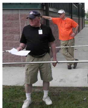
One down four more to go! I have the lunch menu. What is that guy doing in the background? W2KP & N2UNO

For additional Field Day pictures, go to the club website at www.k2br.com Click on the FD 2014 link on the left-hand side of the webpage. Larry KB2MN